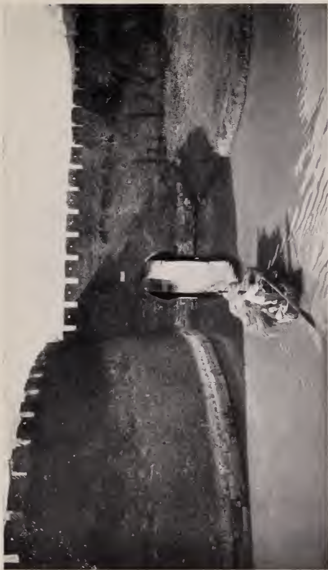
A water-gate entrance to the city of Foochow, China